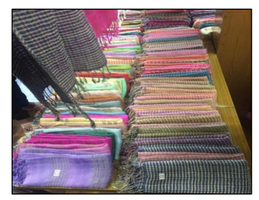
Pure lotus scarf