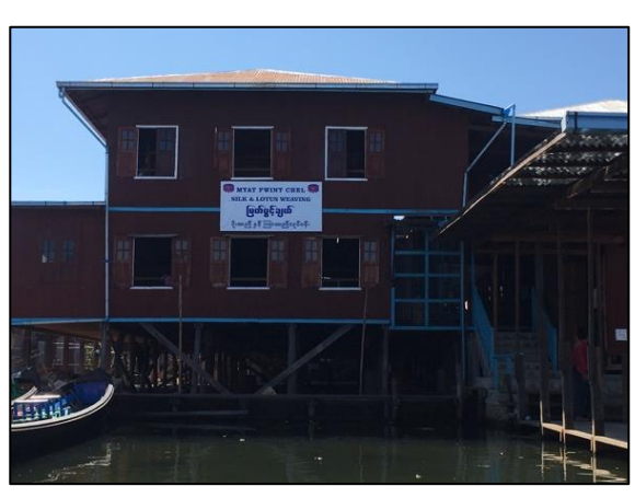
Figure 11: Some lotus product shops in Inle