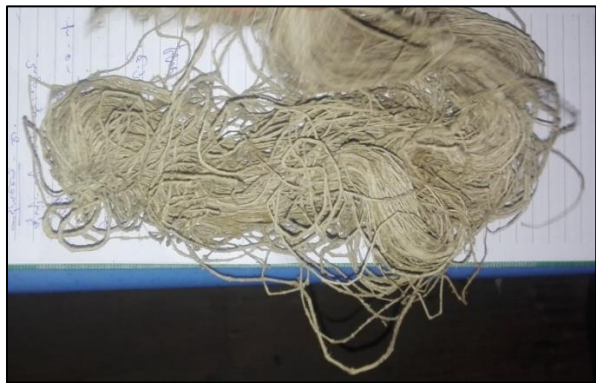
Good quality fibers