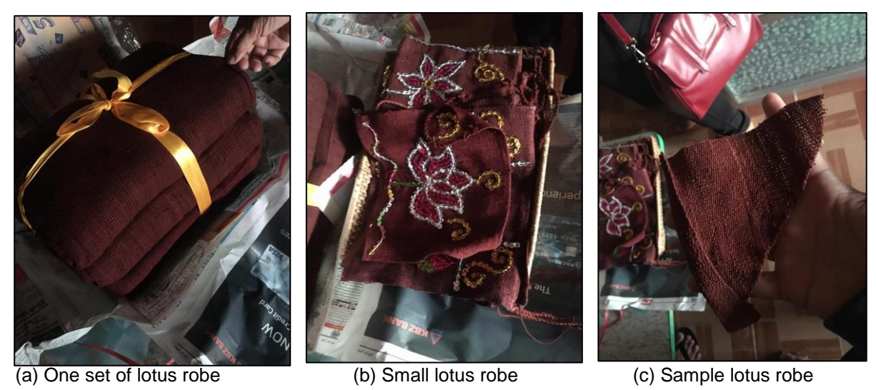
Figure 8 : Lotus robe (a) One set of lotus robe, (b) Small lotus robe and (c) Sample lotus robe