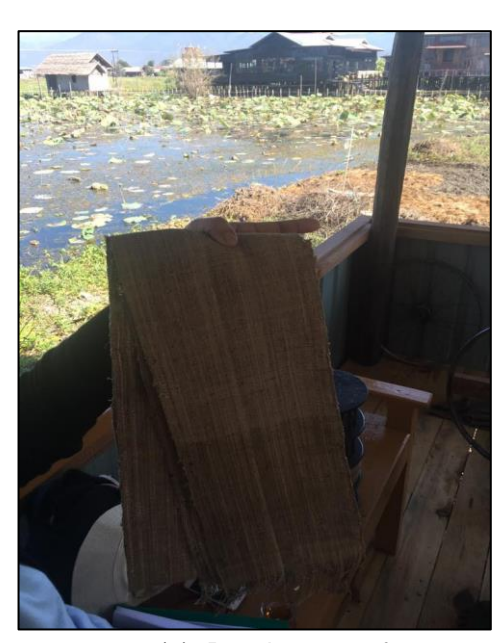
(e) Raw lotus scarf