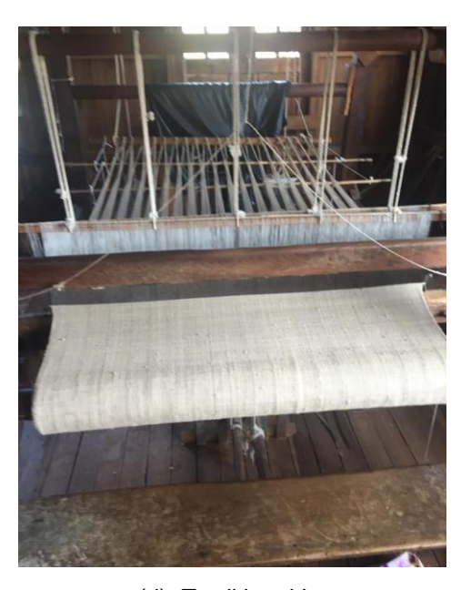
(d) Traditional Loom