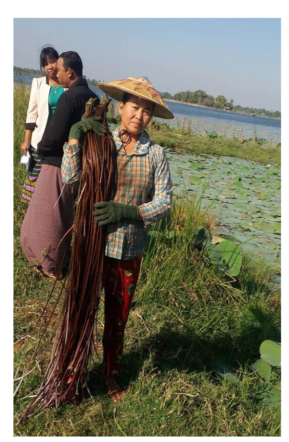
Figure 5: Lotus collector women from Wetthe lake