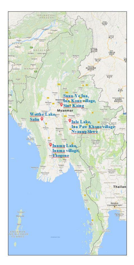
Figure 1: Map of the study areas

As there was no quantitative data collection and as the study is based on the "expert opinion", the findings of the study are of qualitative value; including several case studies. However, in order to ensure consistency of the findings, same information was collected by interviewing different stakeholders involved in a given sector. The list of persons contacted for the study is given in Annex 1. Interaction with various stakeholders was facilitated by either one-to-one interview, discussion in small groups of varied stakeholders, or focus group discussion with the groups of lotus fiber producing labourers.