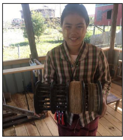
(b) Spinner (to form reel)