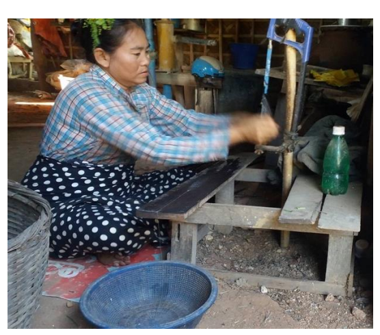
Cutting lotus stem using small and long saw (Wetthe lake)