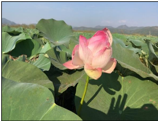
Figure 3: Padon-ma-kya and its flower in Sunn-Ye Inn, Sint Kaing Township

Only the pink color Padon-ma-kya and the stems which are submerged in the water are perfect to produce strong and durable fiber. White and blue Padon-ma-kya cannot use for fiber production (Khine, 2016) . In Myanmar, Innle Lake and WetThel Lake (Salin) are major source of Padon-ma-kya fiber production. Padon-ma-kya can also found in other parts of Myanmar such as the Mong Nai lake-Loilem (the Eastern part of Shan State), the Phaungtaw Lake and the Saka Inn (Kayah State), Sunn-Ye Inn (Sint-Kaing Township,Mandalay Region) and KanGyiDaunt Lake (TeSel Township,Sagaing Region) (Hlaing C. S., 2016; Khine, 2016; Hlaing T., 2016)