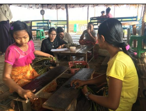
Figure 2: Key informant interview in Inle lake and Sunn-Ye Inn, Sint Kaing Township